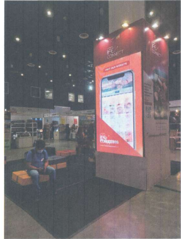
SAMPLE COLUMN CLADDING FROM IFEX 2022 FOR REFERENCE ONLY

STRUCTURE AS PRESENTED DURING MARCH 27, 2023 PRESENTATION OF IFEX