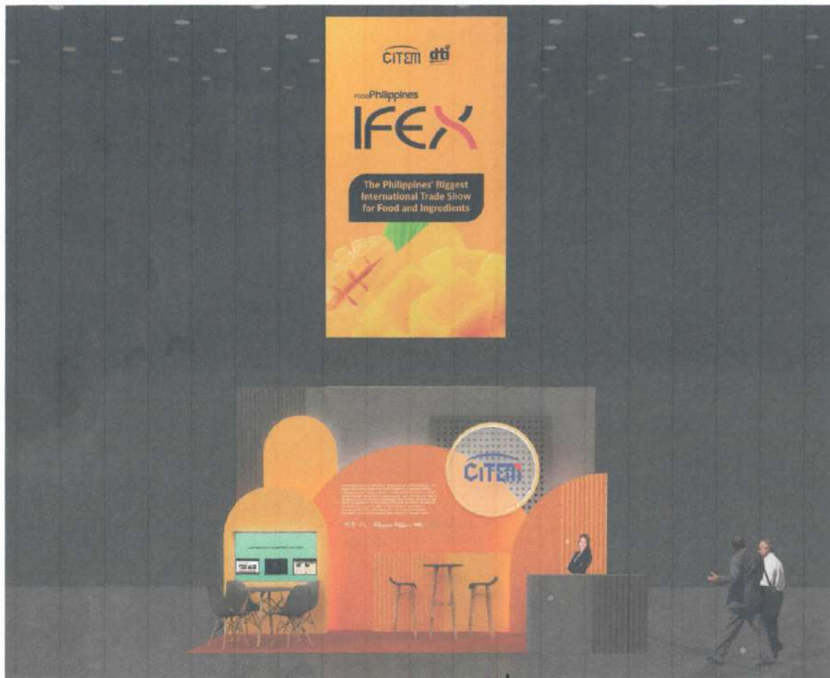
FRONT PERSPECTIVE VIEW