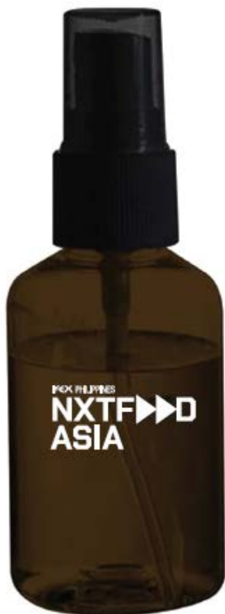
50 ml brown spray bottle