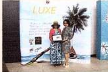
63 rd Manila FAME (April 2015)