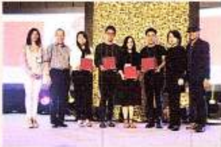
62 nd Manila FAME (October 2014)