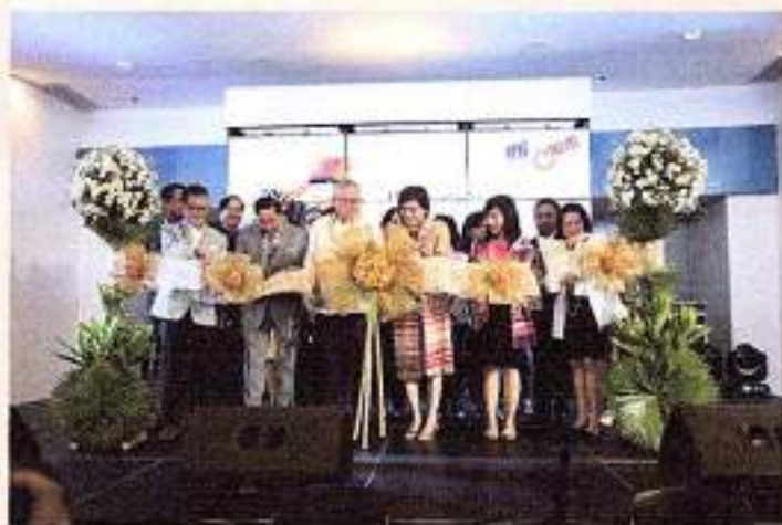
67 th Manila FAME (April 2018)