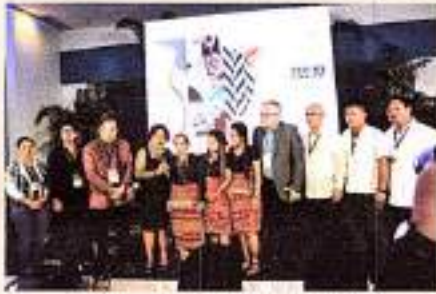
66 th Manila FAME (October 2017)