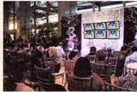
64 th Manila FAME (October 2016)