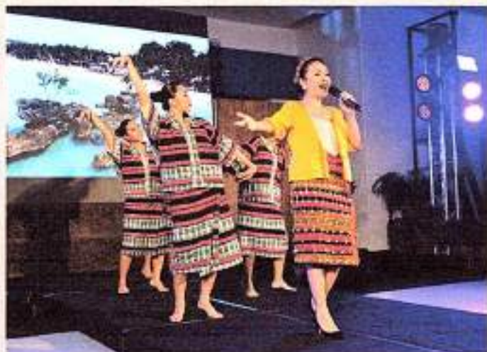
66 th Manila FAME (October 2017)