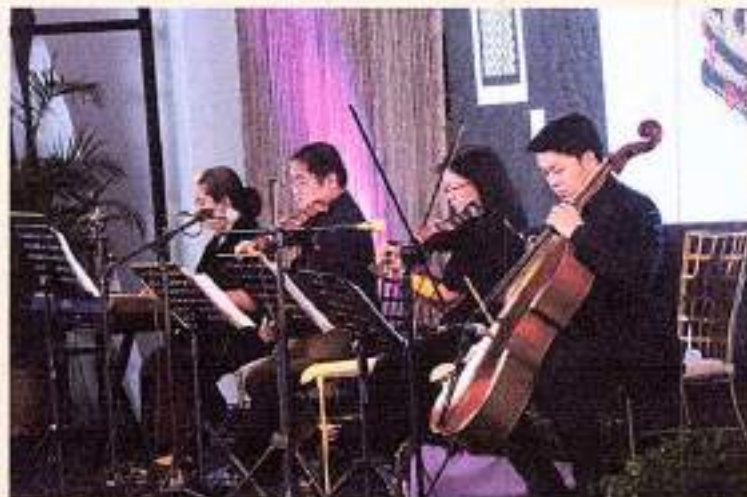
64 th Manila FAME (October 2016)