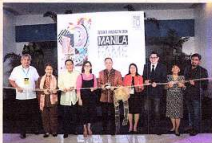
66 th Manila FAME (October 2017)